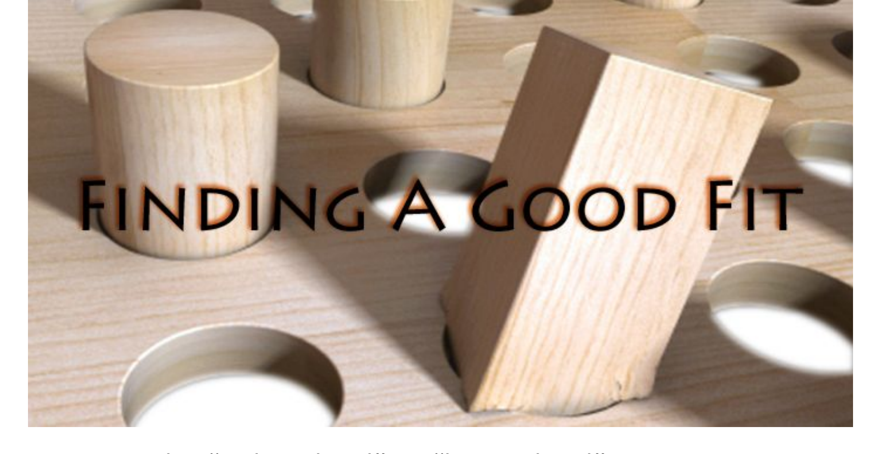
The "right school" or "best school" is unique to each individual, each family.